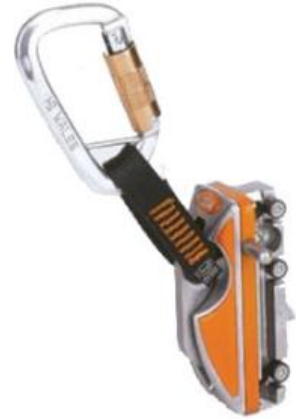
Söll Comfort UK