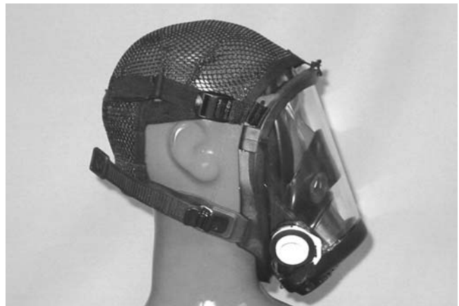
Figure 5. Headnet Properly Installed

When properly adjusted, the Headnet should be centered on the back of your head and the lower straps should be below your ears.