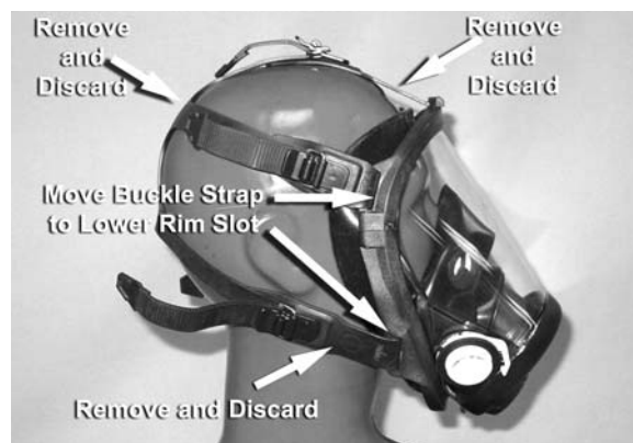
Figure 1. Strap Removal