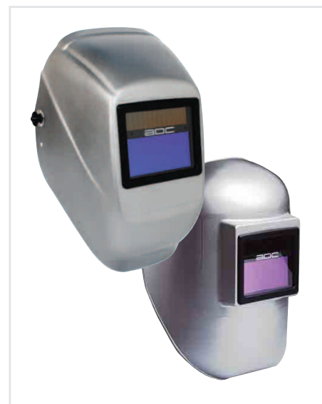
Tigerhood® Futura® with ADF: 2999BVADCSR (top) and Classic with ADF: 999BV913DS (bottom)