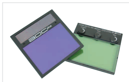
ADF Plus Filter Lens: FMXXLBV913