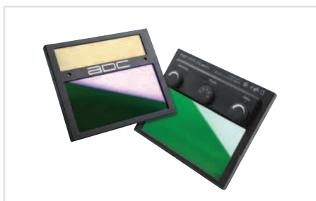
ADF Filter Lens: FMPBV913DSADC