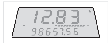
Figure 1: Perpendicular view (top); Angled view (bottom). Demonstrates LCD screens variability in shading when viewed at different angles.