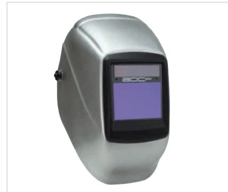
Tigerhood Futura® XXL with ADF: 2090XXLBV913SR

90x110mm ADC ADF Filter, Shades 9-13, Sensitivity and Delay Adjustment, Fits 2999, 999, FMX, 2090