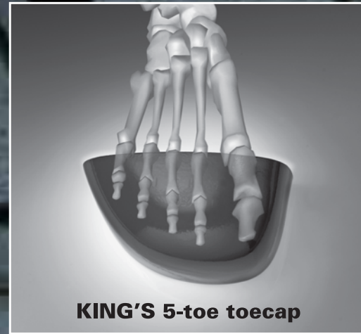
KING'S 5-toe toecap

KING'S spacious 5-toe toecap provides maximum comfort for your toes