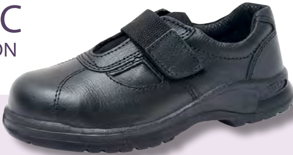
KL221X (Non-safety workshoe, KL221Z) - Black grain leather strap-on shoe - Single density PU outsole - PU foam insole