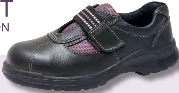
KL225X (Non-safety workshoe, KL225Z) - Black grain leather strap-on shoe - Single density PU outsole - PU foam insole