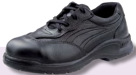
KL331X (Non-safety workshoe, KL331Z) - Black grain leather laced shoe - Single density PU outsole - PU foam insole