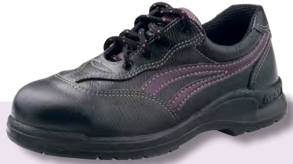
KL335X (Non-safety workshoe, KL335Z) - Black grain leather laced shoe - Single density PU outsole - PU foam insole