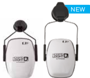
Leightning® EM7206-HL (NRR 27) EM7209-HL (NRR 26)