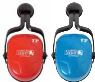
Thunder® EM2177-HL (Red, NRR 23) EM4157-HL (Blue, NRR 23)